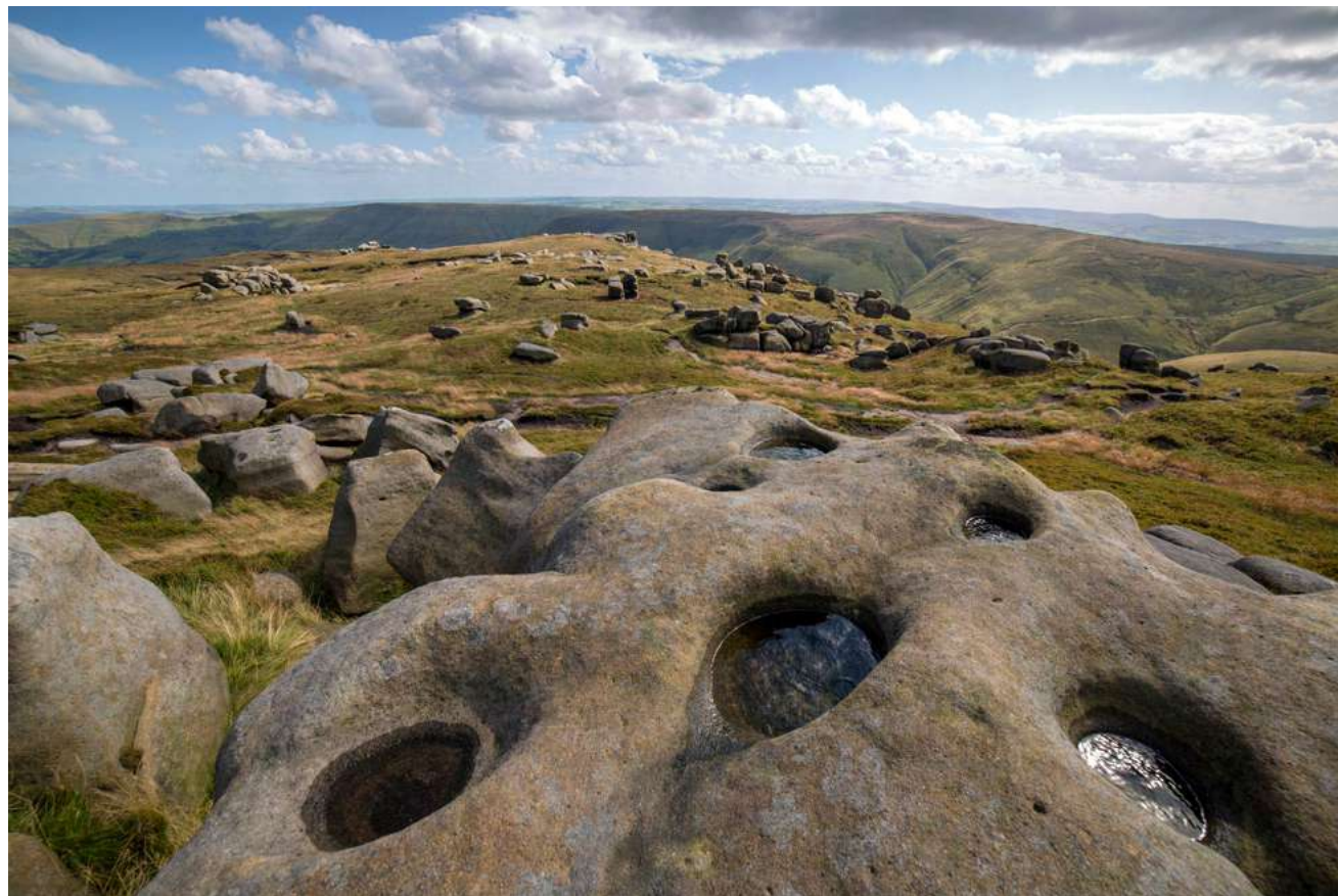
Peak District, Derbyshire 29 miles from Nottingham