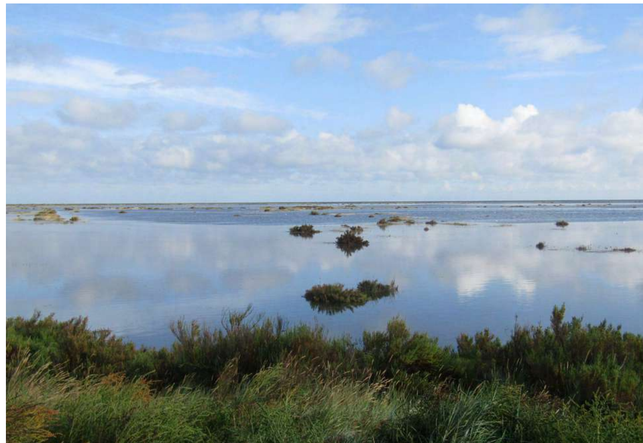
Stiffkey Marshes, Norfolk 32 miles from Norwich