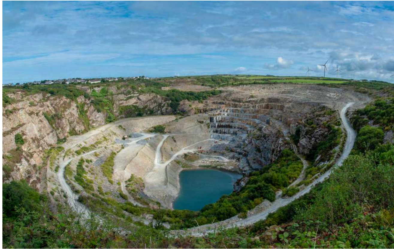
Delabole Slate Quarry, Cornwall 43 miles from Plymouth