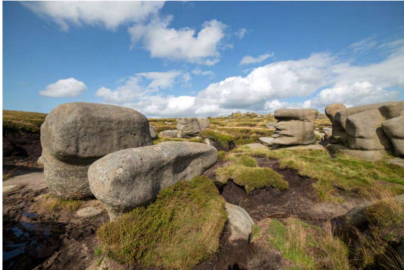
Peak District, Derbyshire 29 miles from Nottingham