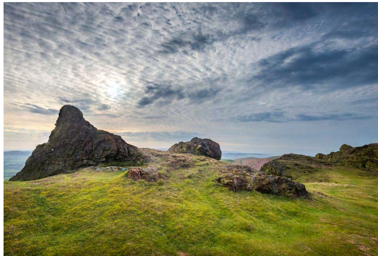
Caer Caradoc, Shropshire 56 miles from Birmingham