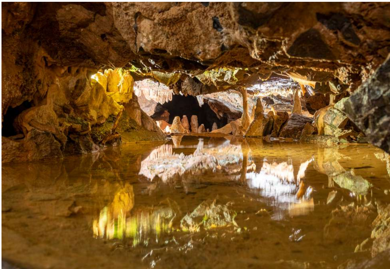
Gough's Cave in Cheddar, Somerset 19 miles from Bristol