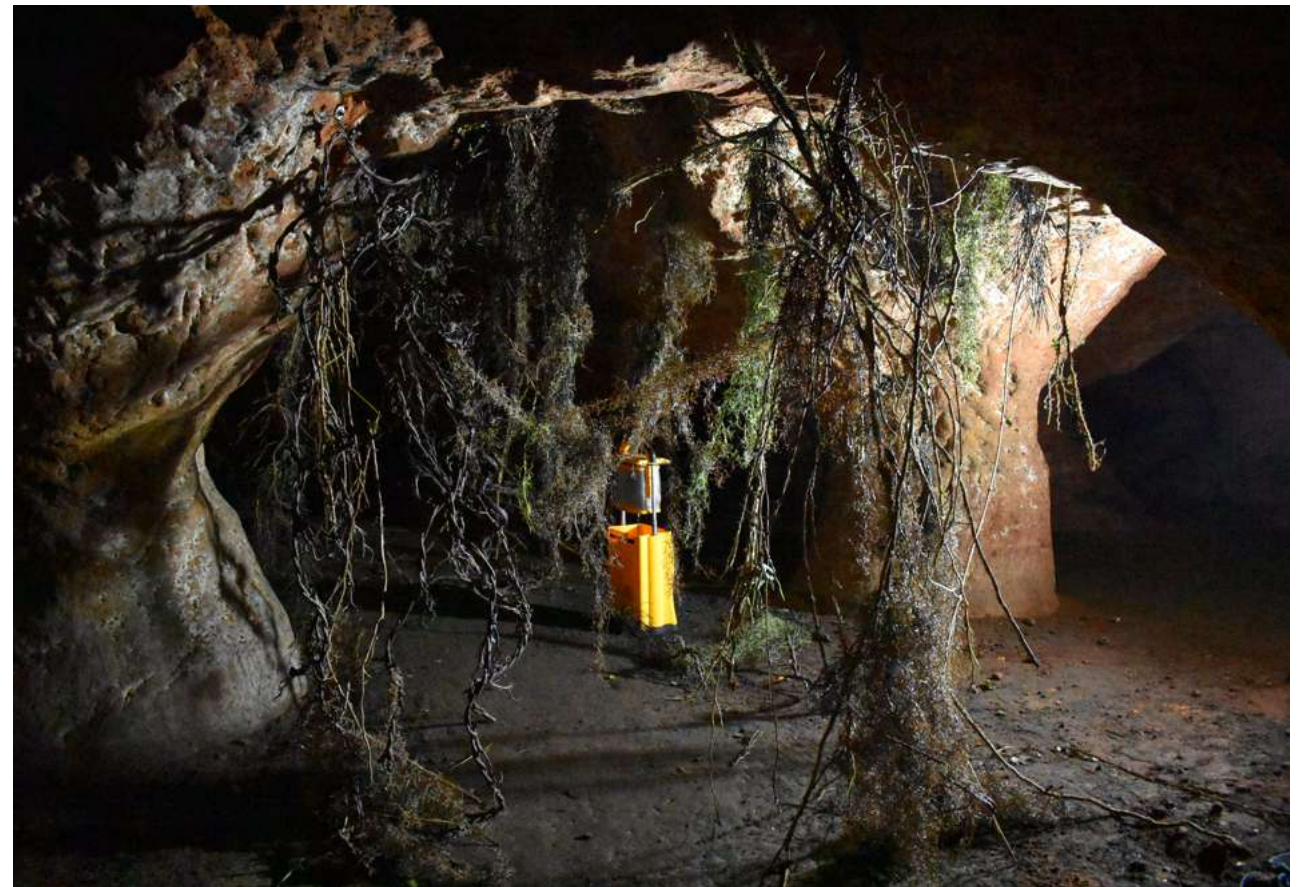
Redcliffe Caves, Bristol