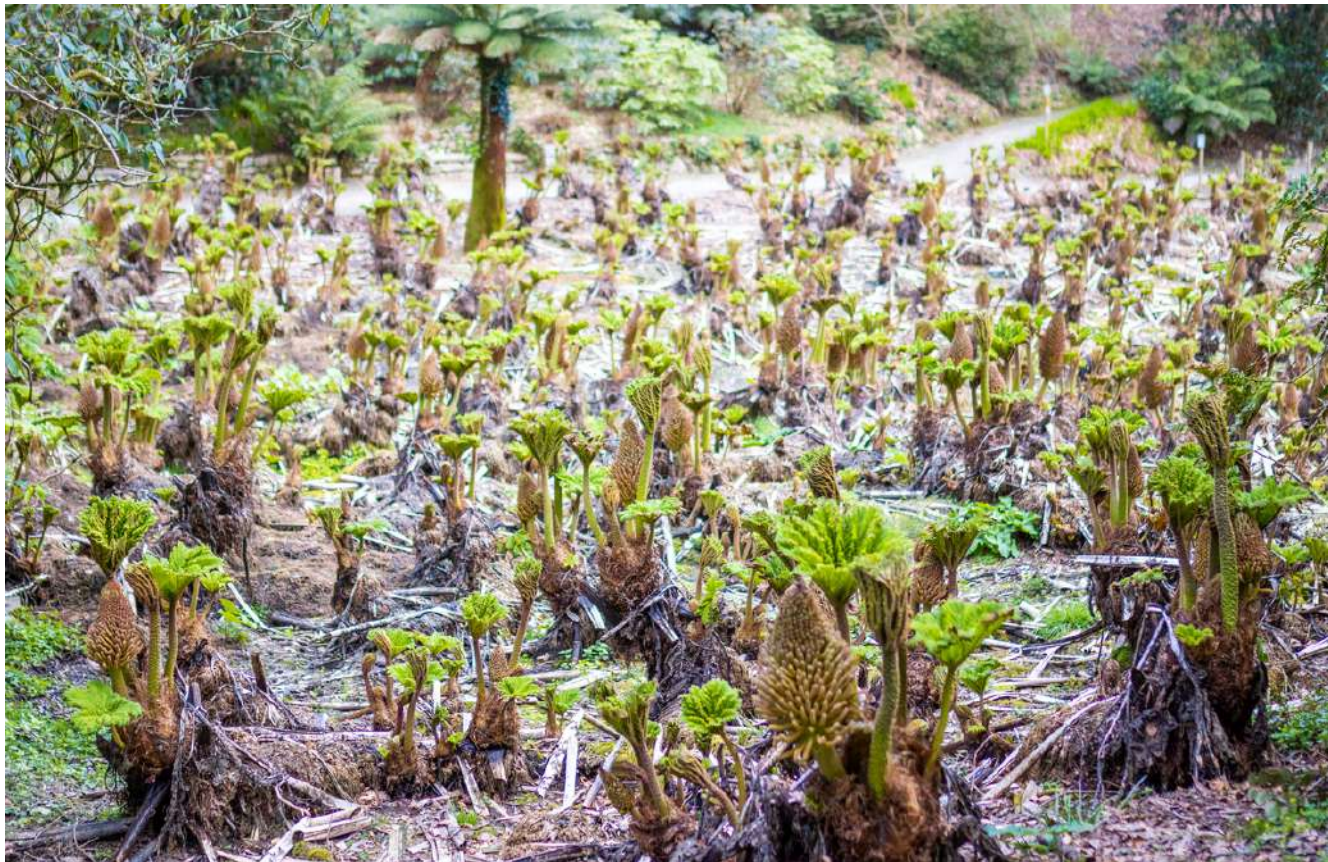
Trebah Gardens, Cornwall 68 miles from Plymouth