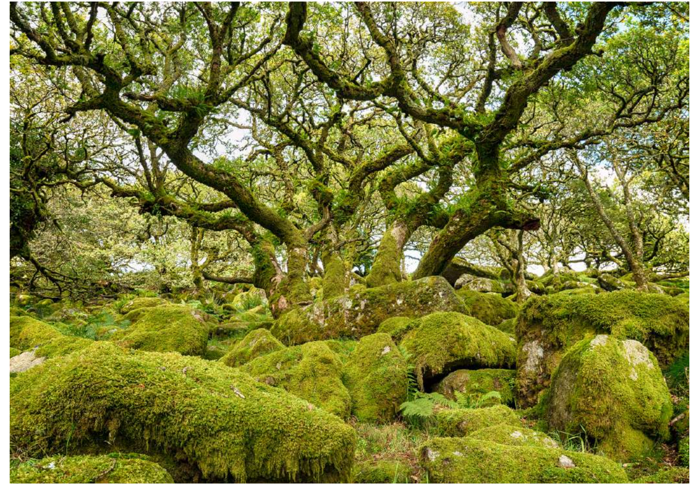
Dartmoor National Park, Devon 7 miles from Plymouth