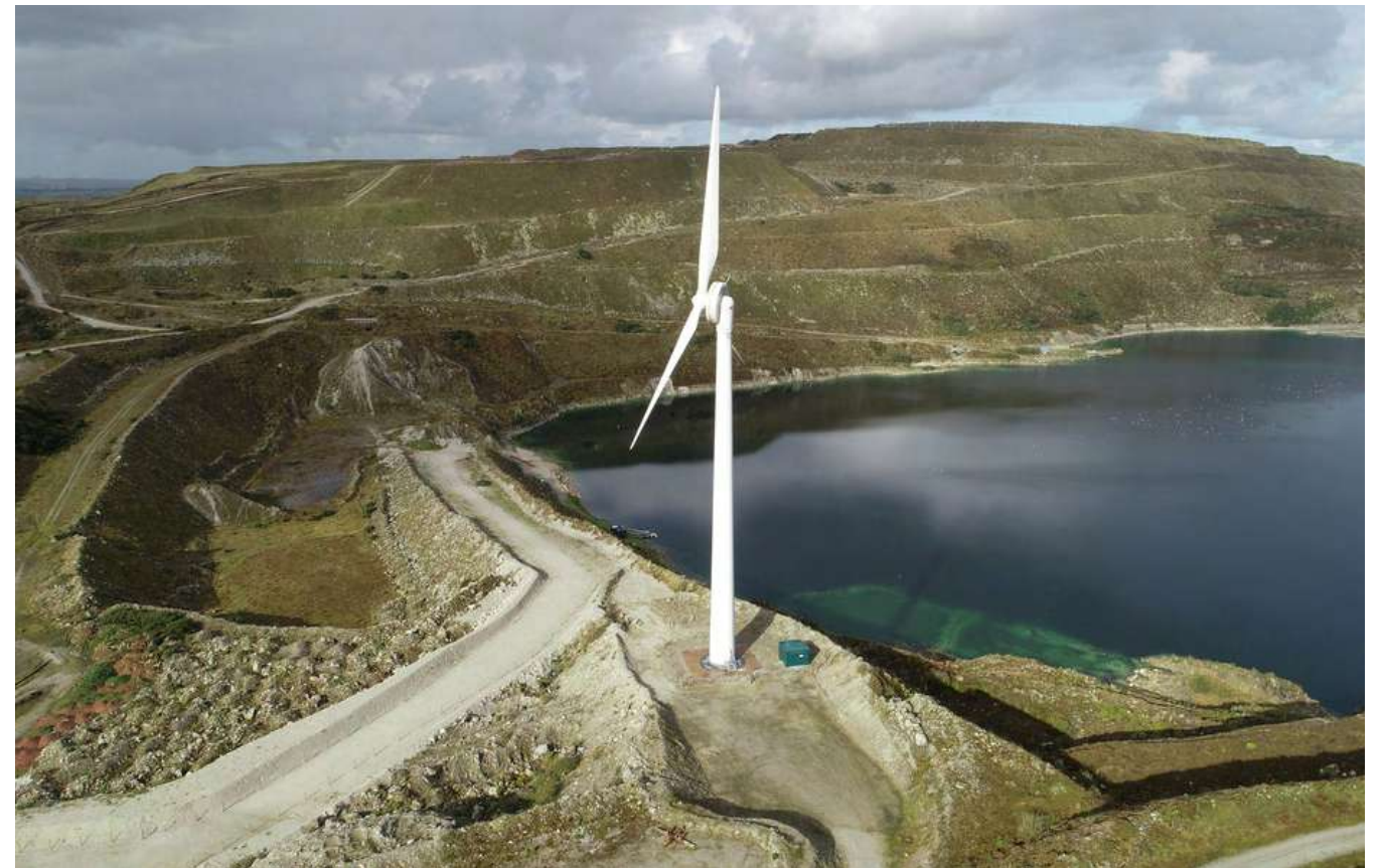
Blackpool Pit, Cornwall 38 miles from Plymouth