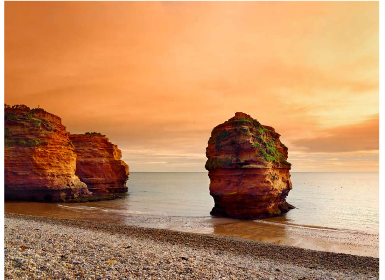
Jurassic Coast, Devon 52 miles from Plymouth