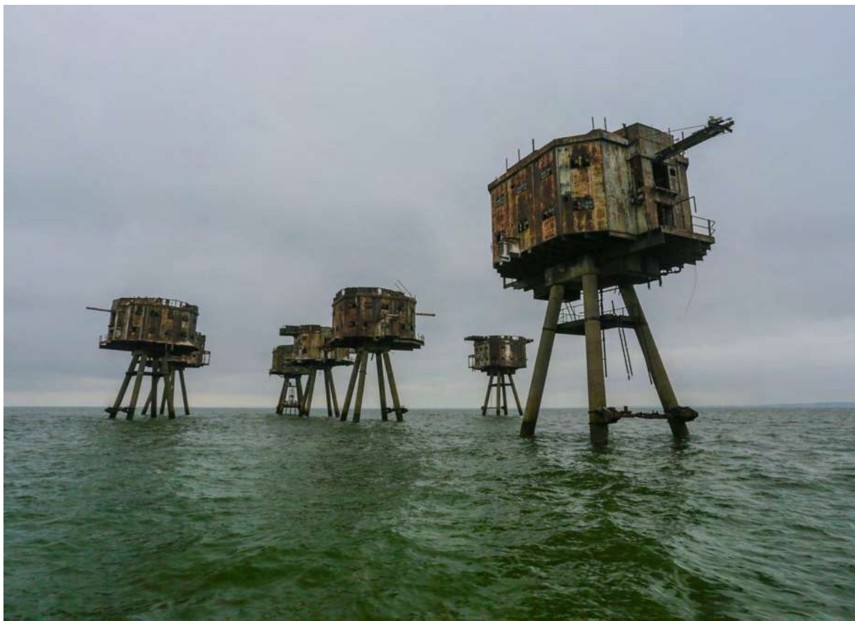
Red Sands Forts, Kent 62 miles from London