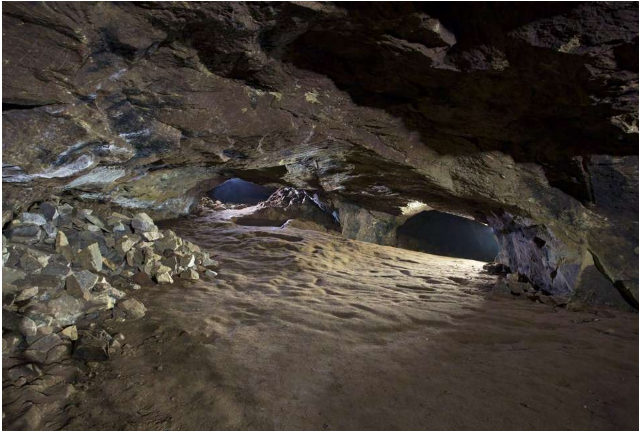
Alderley Edge, Cheshire 15 miles from Manchester