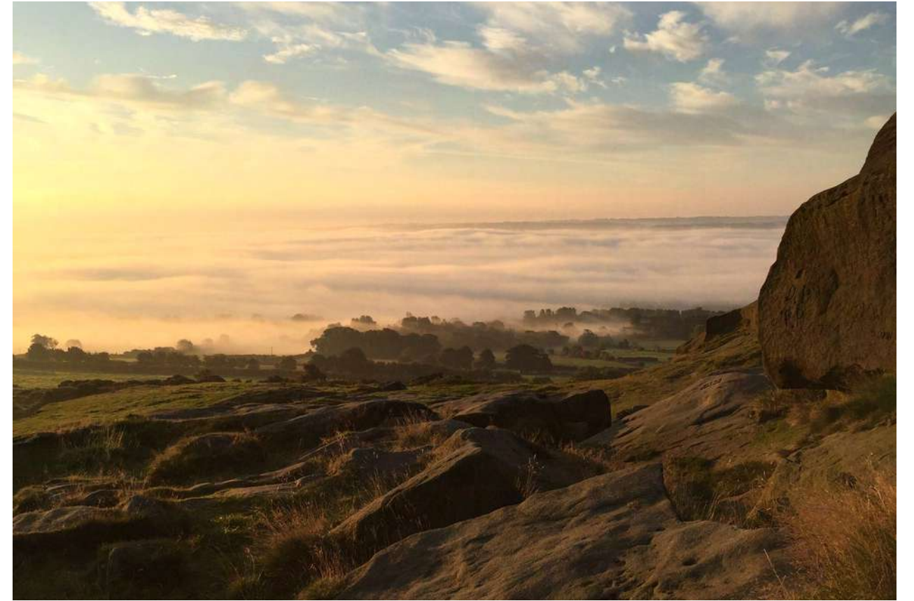
Almscliffe Crag, North Yorkshire 14 miles from Leeds