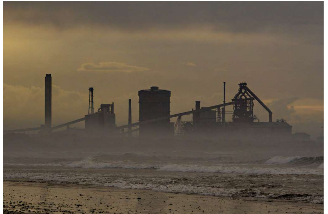
Redcar Beach, Tees Valley 48 miles from Newcastle