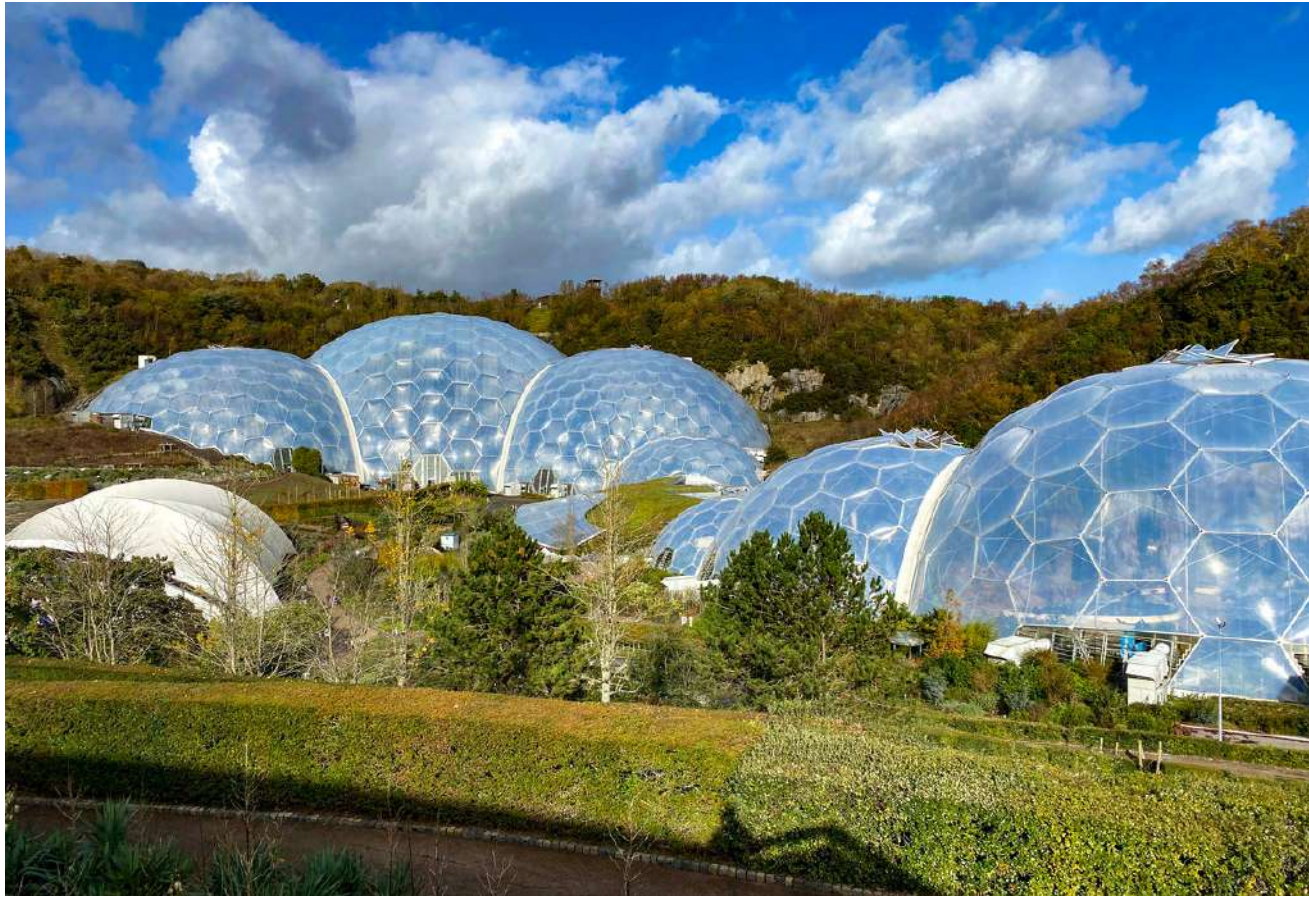
The Eden Project, Cornwall 35 miles from Plymouth