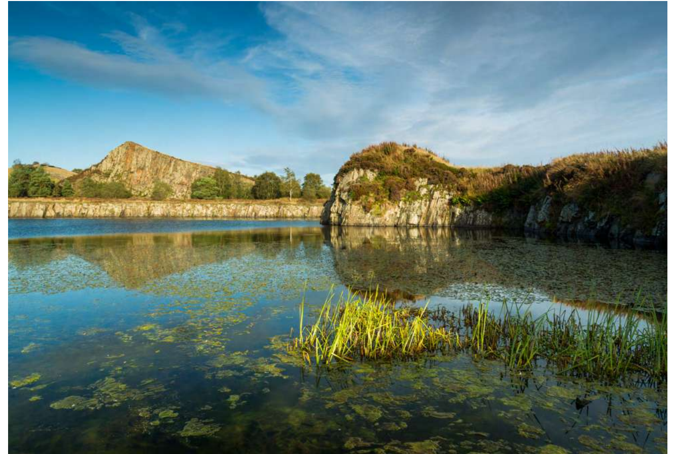
Cawfield Quarry, Northumberland 37 miles from Newcastle