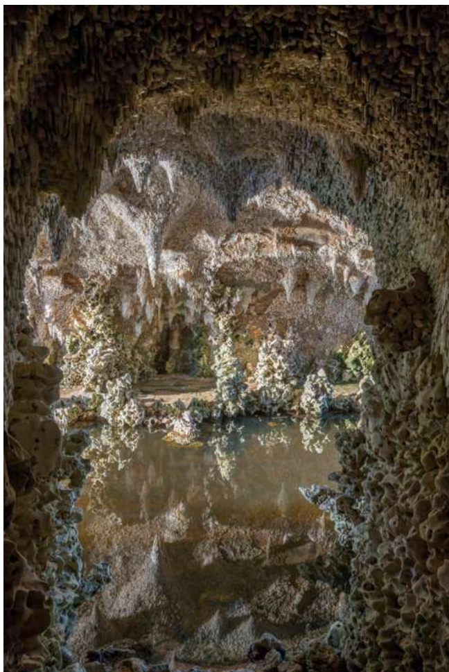
Painshill Cobham, Surrey 22 miles from London